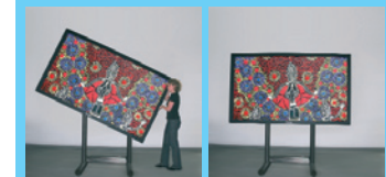
Plasma Displays up to 103"