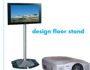
Projectors 3.000-30.000 ANSI Lumen